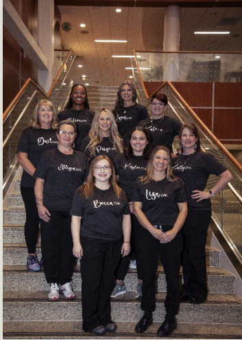
PPG - OBGYN Certified Midwife Team

Parkview's certified nurse-midwives offer expert care throughout women's various life stages, specializing in holistic pregnancy support within a hospital setting. Their comprehensive services include gynecological exams, family planning, STD treatment, prenatal care, labor support, newborn care, menopause care, and emotional support. Certified nurse-midwives prioritize both the physical and emotional well-being of mothers, providing personalized care from pregnancy through delivery and beyond.